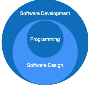
Fig 1: Software Paradigm

Software is the set of program code that is in executable form and fill various needs of computational model. Software when developed for particular application then it is called software product.