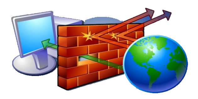
Fig- A Network Firewall

Firewalls are special router designed to perform inspect network traffic smartly to what should be forwarded and what traffic should be dropped or let in. It is a well-established and integral part of network security. It monitors the incoming and outgoing traffic based on some security rules. It also determines the direction in which a particular traffic may be initiated and allowed to flow through it. It works like a barrier between a secured internal network and other outside network. In an enterprise, firewalls are deployed within internal network to partition segments. A firewall can be implemented either in the IP packet layer or high IP layers. [9]