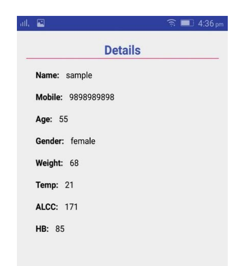
Figure 4: Android application display