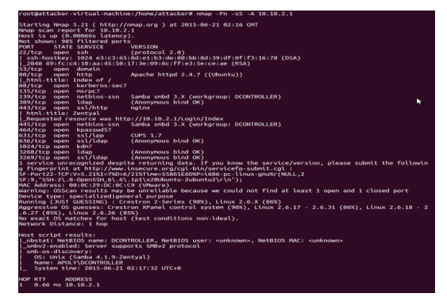
Fig 9: Port scan results from Nmap

was executed and the resulting output displayed in figure 16 further revealed 15 opened ports and that what appeared to be running on the zentyal server was a web server. This was typical when attacking Internet-facing systems, most of which limited the ports accessible by Internet users. Port 80, the standard HTTP port was found opened and listening, Port 22, the standard ssh port was also found opened and listening. Upon further investigation, A web application in figure 11 displayed Accra Technical's Admissions online management system on browsing the IP address 10.10.2.1:80. Figure 10 shows the corresponding intrusion detection alert captured by the Distributed Intrusion Detection facility installed and configured on the Zentyal server.