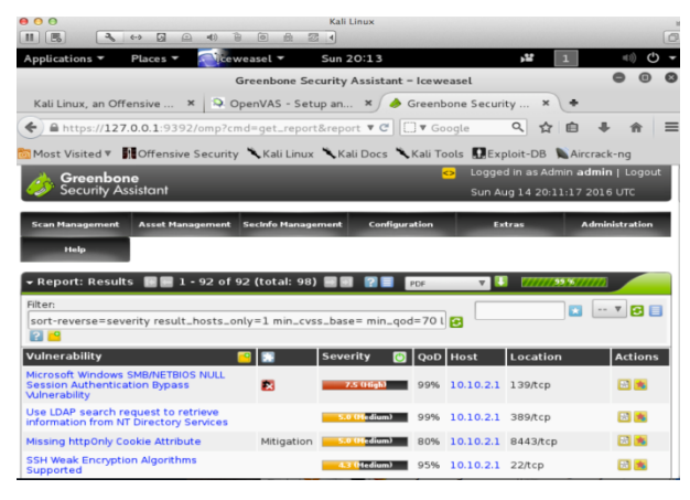
Fig 12: OpenVAS search report

At this point, OpenVAS which is an open source initiative of vulnerability assessment was launched and its web-based (Greenbone security assistant) interface was logged into. OpenVAS was then configured to search for a set of network vulnerabilities by just typing in the IP address of the targeted machine. OpenVAS then scanned the targeted system against the list of known vulnerabilities included in its NVT Feed as shown in figure 12. Once completed with the vulnerability scanning steps, the knowledge necessary to attempt to launch exploits against targeted system had been established. Moving forward, the Metasploit Framework was employed to exploit the known vulnerabilities of the targeted machine thus, further scaling down to specific and critical vulnerabilities. By which time, the Intrusion detection system which had been installed and configured on the targeted machine was already up and running.