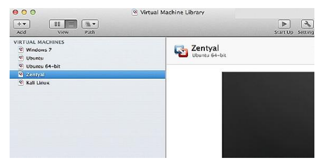
Fig 3: VMachine showing the various guest OS

The VMware Fusion installation was started by doubleclicking on its executable file (which contained a 64-bit architecture). In parallel, the virtual laboratory was fully constituted with the aid of some other free open source software called Kali Linux formerly known as BackTrack, which served as the attacking agent, Metasploit Framework as the main exploitation tool, OpenVAS as the Vulnerability assessment software and above all, Zentyal server 4.2 as the unified network server. The VMware Fusion virtual machine was run on a Mac OS X host operating system. Having installed VMware Fusion, new Guest Operating systems were created and specified the ISO files of the windows 7, Kali Linux and Zentyal servers respectively as shown in figure 3.