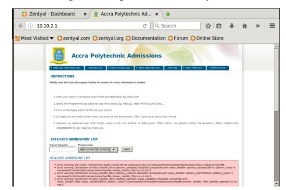
Fig 11: The detected HTTP protocol with port 80 running the web application