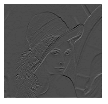
Fig. 4: Edges along Y-axis

A zero-mean Gaussian membership function for each input is specified and the degree of membership function is stated according to gradient value of pixel. Output membership functions are also defined. Thus, the final edge detection of the image is obtained which is shown in figure 5.