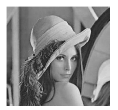
Fig. 7: Stego image

Hence, using fuzzy edge detection and k-mean clustering a new algorithm for embedding the secret data in to cover image is achieved. The PSNR, MSE and the payload values are shown in table 1.