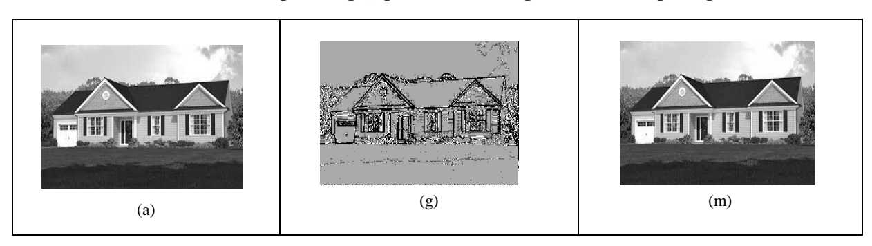
Table 2: (a)-(f) Original Images, (g)-(l) Clustered Images and (m)-(r) Stego Images

In last section, fuzzy logic method for edge detection has been used. This method is tested on various images of different pixel sizes and their results are analyzed in this section. Also, the results have been compared with same algorithm but using a different edge detection technique which is the sobel edge detection. The results are shown in table 2. Six different images which are house, camera girl, tree, skyscraper, sunflowers and sun are considered. The original grayscale image are shown in column one of the table 2 (a)-(f), the images obtained after performing edge detection and k-mean clustering are shown from (g)-(1) in table 2 and finally the stego images are shown in third column of the table 2 from (m)-(r).