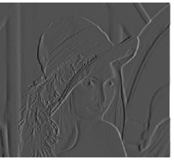
Fig. 3: Edges along X-axis

The edges of this image are to be found by using the fuzzy edge detection method which is based on Fuzzy inference system (MATLAB FIS toolbox). The fuzzy logic edge-detection process relies on the image gradient to locate breaks in uniform regions. The image gradient both along the x -axis as well as y -axis has been considered. The results of Ix and Iy are shown in figure 3 and 4. These figure shows the edges of the image, both in horizontal as well as vertical direction.