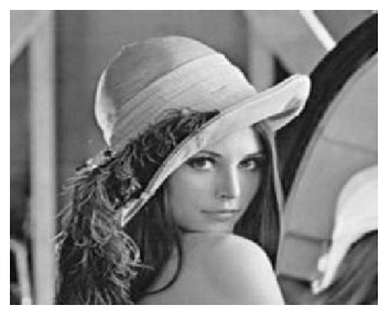
Fig. 2: Cover image (Grayscale representation)

First of all the gray color image of the cover image is considered which is shown in figure 2.