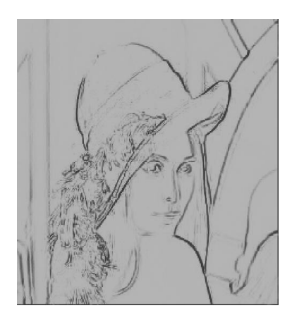
Fig. 5: Edge detection using fuzzy logic

After edge detection clustering of the pixels using k-mean clustering technique has been performed. The clustered image is shown in figure 6. Next the data has been embedded in the original grayscale image. This is done in accordance with the values of pixels obtained after clustering process. The edge pixels are embedded with high number of bits and the smooth pixels are embedded with lower number of bits. This is done to achieve a high embedding capacity as well as to maintain an acceptable image quality of the stego image with a high value of PSNR and least value of MSE. The stego image so obtained is shown in figure 7.