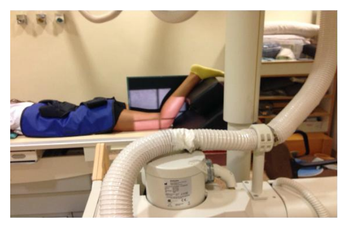
Figure 2. Lateral x-ray of the left knee.

Each evaluator noted the value obtained on a specificallydesigned template without disclosing any information to the others. Finally, Figure 2 shows all subjects were subjected to a lateral radiograph, with the knee joint in the initial position.