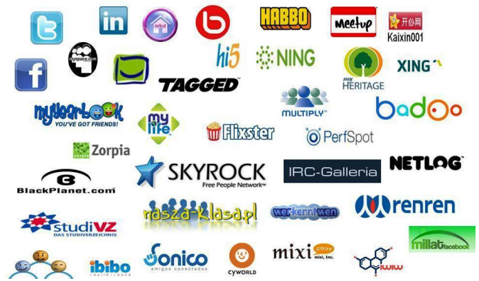
Fig. 1. The different types of popular social networks and blogs.

A social networking service is a platform to build social networks or social relations among people who, for example, share interests, activities, backgrounds, or real-life connections. It consists of a representation of each user (often a profile), his/her social links, and a variety of additional services. Most social network services are web-based and provide means for users to interact over the Internet, such as e-mail and instant messaging [8]. Social networking sites allow the users to share ideas, pictures, posts, activities, events, and interests with people in their network.