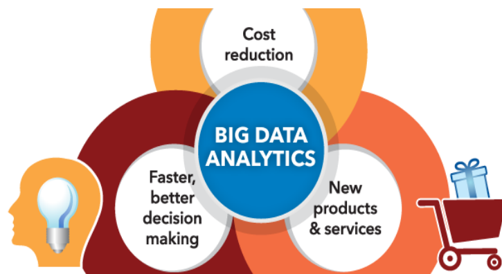
Figure 4 Big data analytics: Cost reduction, decision making and products and services

Big data analytics is the process in which we examine the huge amount of data to find some important information or some hidden data, unknown complementary relationships, market inclinations in particular directions, client preference, and other notable business information. Analytics [45] find the easy and more effective way of marketing, new and effective revenue opportunities and better client service, improve efficiency, advantage over organizations and other business benefits.