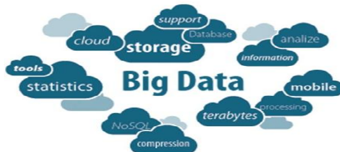
Figure 1 Big Data and its characteristics