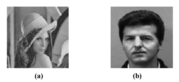
Figure 4. Watermark Face images (Size 128 x 128).