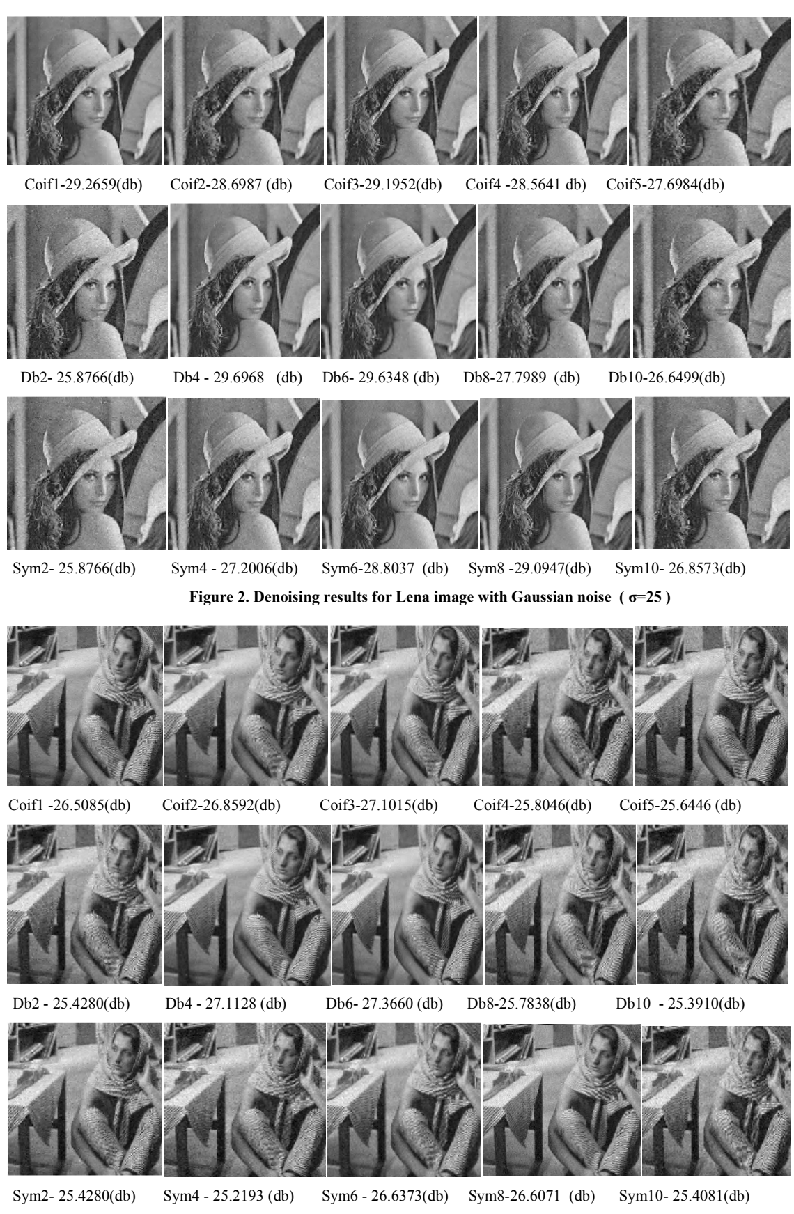
Fig 3. Denoising results for Barbara image with Gaussian noise ( \sigma=25 )

International Journal of Computer Applications (0975 – 8887) Volume 15– No.8, February 2011