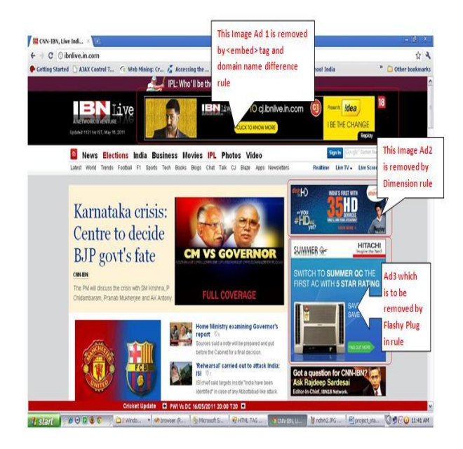
Fig 3: Before removal of image advertisement

The following fig 3 and fig 4 shows the result before and after Image advertisement removal.