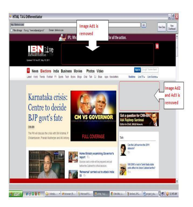
Fig 4: After removal of Image advertisement