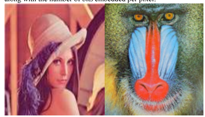
Figure 4 a. Lena

For implementing the above discussed process, four standard color cover images shown in Figure 4a, 4b, 4c and 4d of size 256 x 256 pixels namely Lena, Baboon, Airplane and Brihadeeswarar Temple have been selected. The effectiveness of the stego process proposed has been studied through the following three different metrics for all the four digital images in RGB planes. The results obtained have been tabulated separately for the three different planes and also the average of all the planes has been calculated along with the number of bits embedded per pixel.