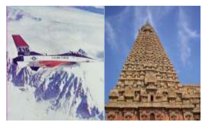
Fig 5. Stego output for full embedding capacity