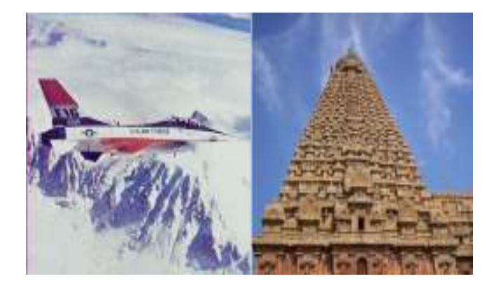
Figure 4.c. Airplane 4.d. Brihadeeswarar Temple