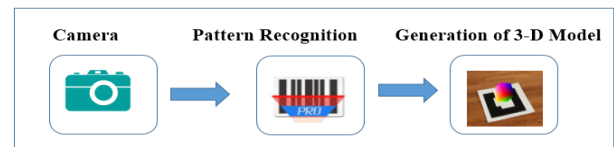
Fig 1: A block diagram to generate 3-D Model

In this system, live feed camera image (i.e., 2D image on paper) is captured by the camera, called Tracker image. The next step is the Pattern Recognition phase, here the tracker image is processed with the help of Image processing model to identify Patten behind 2D image and connect that recognized Patten with appropriate 3D object shown Figure 1.