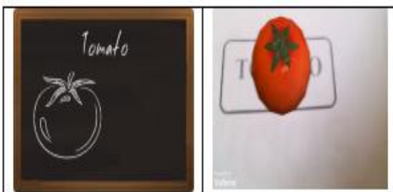
Table 1. Black board Image and Augmented Object

The augmented 3D objects look as identical as real objects in the real world.