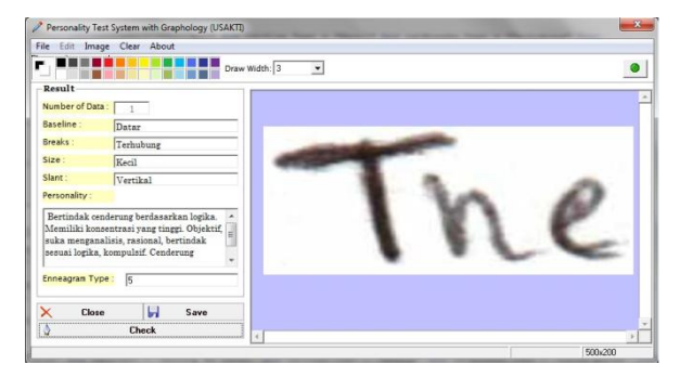
Figure 5. Handwriting Analysis Menu

On the menu at the top, shows that images of handwritten notes of the respondents will be extracted the shape features with a series of processes, which will then be assessed by a system of personality types and descriptions. Those results will then be matched with the enneagram assessment results :