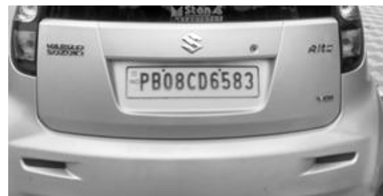
Fig 2: Gray scale image.

After the grayscale conversion in this paper adaptive thresholding is applied to convert the gray scale image into a binary image. After the binarization the median filter is applied to remove the noise from the vehicle image. Median filter is a non- linear filter and it replaces the gray value of a pixel by the median of the gray value of the pixel.