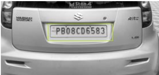
Fig 4: Localized License plate