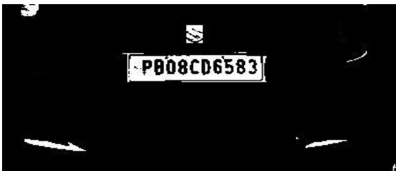
Fig 3: Multiple Probable Region