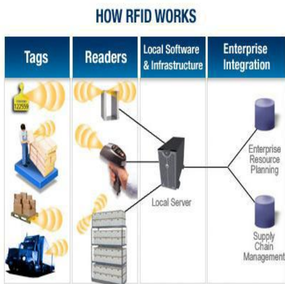
Fig 1. Architecture of RFID

topic in all definitions of the Internet of Things include smart objects, machine to machine communication, RF technologies, and a central hub of information. The concept of the internet of things first became popular in 1999, through the Auto-ID Center at MIT and related market-analysis publications. Radio-frequency identification (RFID) was seen by Kevin Ashton (one of the founders of the original Auto-ID Center) as a prerequisite for the internet of things at that point. If all objects and people in daily life were fitted out with identifiers, computers could manage and inventory them. Besides using RFID, the tagging of things may be accomplished through such technologies as near field communication, barcodes, QR codes and digital watermarking. Typically, IOT is expected to offer advanced connectivity of devices, systems, and services that beyond machine-to-machine(M2M) communications and covers a variety of protocols, domains, and applications.