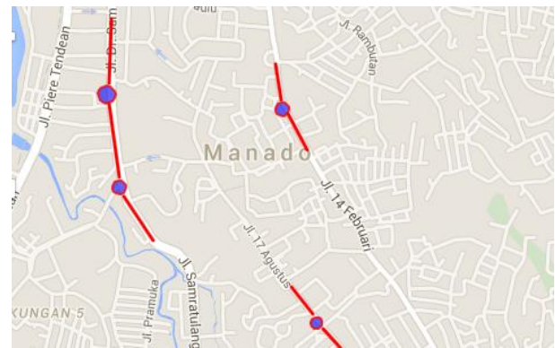
Fig 3. Display current coordinates of observed accidents.

The information system is the system provides an indication of any signal detected by the map location of the object with the coordinates of which is shown in Figure 3 .