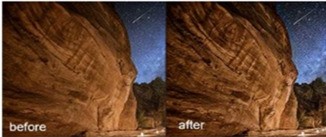
Fig 1: Image Enhancement