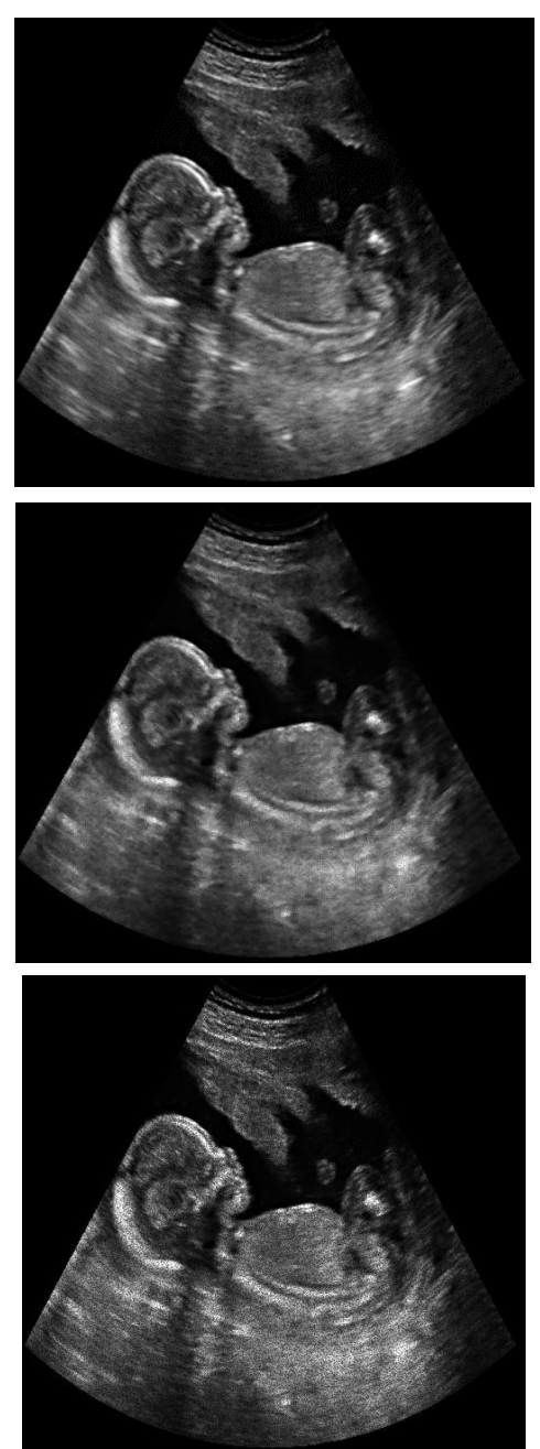
Figure, Image in the 1st row is the noise free image, 2nd row is the denoised image and image in the 3rd row is the noisy image.

The images in the figure below shows have been presented to show the effect of speckle noise. The noise free image is taken and speckle noise is added to it. It is then denoised using our proposed technique. The denoised image is very much similar to the noise free image.