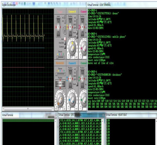
Figure 2. Circuit simulation output

The circuit simulation output is as shown on the figure below. This is the output notifications messages from the system. The message displays the heart beat rates, body temperature and status of the horns synchronizations. It also shows response signal sent to drone, mobile phone and data base.