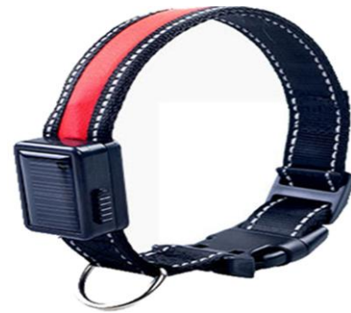
Figure 4. 3D model of the solar powered collar belt

The signal from the sensors are processed by PIC XMEGA256A3 microcontroller and sent wirelessly by the Zigbee router which is received at the other end by the Zigbee coordinator.