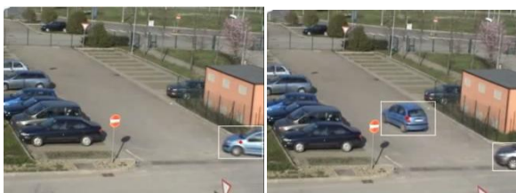
(a) Figure 3 (b)

Object detection and tracking are interrelated because tracking usually starts with detection while detecting an object repeatedly in a subsequent image sequence is often necessary to help and verify tracking. Every tracking method requires an object detection mechanism either in every frame or when the object first appears in the video [2]. In general, the three basic tracking methods such as; point-based tracking, kernel-based tracking and silhouette-based tracking method and many more have been suggested for tracking moving object. Paper [10] also explained object tracking as while as background model which is employed in tracking for a successful segmentation of background and tracking of moving object in video stream.