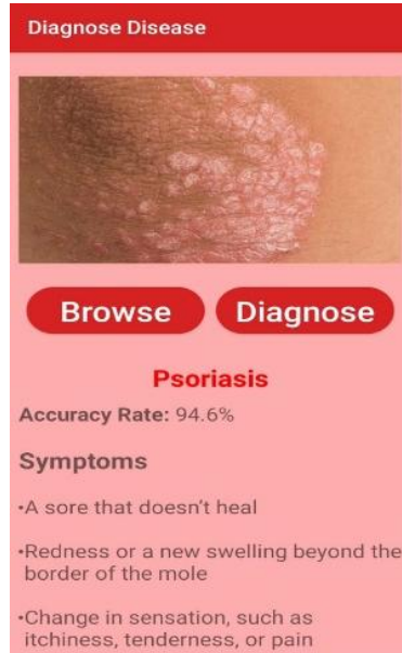
Figure 5: Output of Disease Diagnosing

The proposed system can successfully diagnose Melanoma & Psoriasis with 90% accuracy. After the user uploaded the affected skin image, the mobile application will process the image and display the name, symptoms, and treatment shown in Figure 5 as the output.