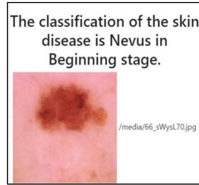
Figure 6: Identified Stage

The system has successfully diagnosed the stages of Nevus & Melanoma as Begin or Malignant. The system will help the user identify the disease, and its stage user will decide whether it can be harmful or not or any other way to cure it, and it helps the user identify skin diseases in the early stages. Identified Stage is shown in Figure 6