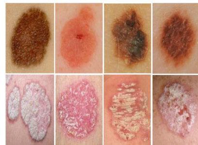
Image acquisition is the initial step of the image processing technique. In this step, the images of the dermatological diseases are captured through the camera of the smartphone. Disease images are shown in Figure 1