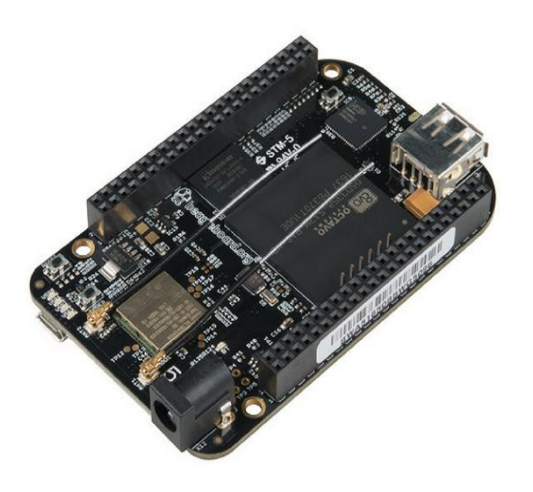
Figure 3 BeagleBone Black 2.4 NVIDIA Jetson

Jetson is designed as a powerful computer that lets the user run artificial intelligence and machine learning applications, while taking up only very little power and space [3]. Products in the Jetson portfolio include Nano (Figure 4), Xavier NX, AGX Xavier, and TX2. Among these products, Jetson AGX Xavier is the first computer designed specifically for autonomous machines. All Jetson boards come bundled with software libraries for deep learning, computer vision, GPU computing, multimedia processing, and much more. Jetson relies on the Linux environment and provides better performance than other development boards. The availability of proprietary AI and ML tools from NVIDIA reduces the work for developers. One of the biggest advantage that Jetson offers is the GPU-accelerated parallel processing. This makes Jetson an ideal choice for developers looking to implement machine learning projects. Jetson hardware is ideal for training and inference phase of deep learning problems. Jetson is commonly deployed as Network Video Recorders (NVRs), smart home robots, and intelligent gateways [6].