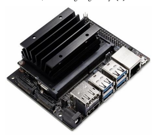
Figure 4 NVIDIA Jetson Nano

Jetson is designed as a powerful computer that lets the user run artificial intelligence and machine learning applications, while taking up only very little power and space [3]. Products in the Jetson portfolio include Nano (Figure 4), Xavier NX, AGX Xavier, and TX2. Among these products, Jetson AGX Xavier is the first computer designed specifically for autonomous machines. All Jetson boards come bundled with software libraries for deep learning, computer vision, GPU computing, multimedia processing, and much more. Jetson relies on the Linux environment and provides better performance than other development boards. The availability of proprietary AI and ML tools from NVIDIA reduces the work for developers. One of the biggest advantage that Jetson offers is the GPU-accelerated parallel processing. This makes Jetson an ideal choice for developers looking to implement machine learning projects. Jetson hardware is ideal for training and inference phase of deep learning problems. Jetson is commonly deployed as Network Video Recorders (NVRs), smart home robots, and intelligent gateways [6].