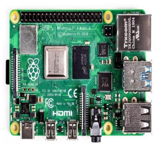
Figure 2 Raspberry Pi Model B

Raspberry Pi (Figure 2) is a family of single-board computers that comes with great processing power in a small package and provides the functionalities of a desktop computer. Raspberry Pi's development began in 2006 it was finally released on 19 February 2012 as two models: Model A and Model B. After the sale of 3 million units by May 2014, Model B+ was announced in July 2014. Raspberry Pi or RPi, as it is known in the hobbyist circles, can support an operating system and is seen as a low-cost replacement for desktop PCs. The operating system is installed on an SD card and provides you the familiar interface that you expect from a Linux or Windows computer [5]. Raspberry Pi supports a number of operating systems, including Raspbian Linux, Ubuntu Mate, and Windows 10 IoT Core. As Raspberry Pi can maintain a complete operating system, it has support for languages like C/C++, Python, and JavaScript. The latest iteration of the board, the Raspberry Pi 4 features a Quad core 64-bit ARM-Cortex A72 running at 1.5GHz.