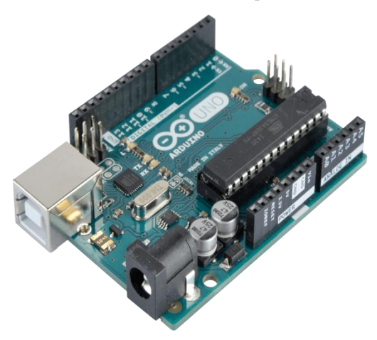
Figure 1 Arduino Uno

Arduino is undoubtedly the most favourite development board among developers and hobbyists. There is an active community working on this platform. Arduino has a broad range of boards, from simple 8-bit microcontroller boards to products for wearables, IoT items, three-dimensional (3-D) printing, and much more. The most popular model of Arduino, the Arduino Uno (Figure 1) is based on ATmega328P microcontroller. An Arduino board is programmed with the help of an IDE, using a type B USB cable. The company also offers boards like Arduino Yun, with on-board Wi-Fi (IEEE 802.11 b/g/n) and Ethernet (IEEE 802.3 10/100Mb/s) [3]. But, Arduino is known around the world for its low-cost 8-bit and 16-bit models. Low end boards like these does not require an OS. Code for Arduino follows the structure and conventions of C language. Support for peripherals, sensors and actuators is provided through header files. Once the code is saved on the board, it is executed in an endless loop [4].