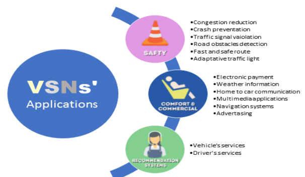
Figure 1.1 Applications of VSNs

The main possible applications of VSNs can be showed in Figure (1.1). Many novel VSNs' applications can be added to the VANET's applications. They are ranging from (safety – comfort – commercial) applications. Furthermore, recommendation systems to advise options for vehicles or drivers who need them can be a wide research space.