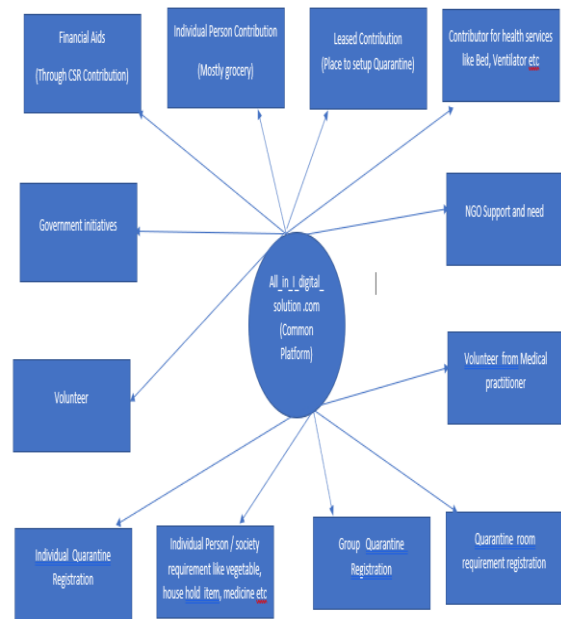
Fig: Proposed Solution