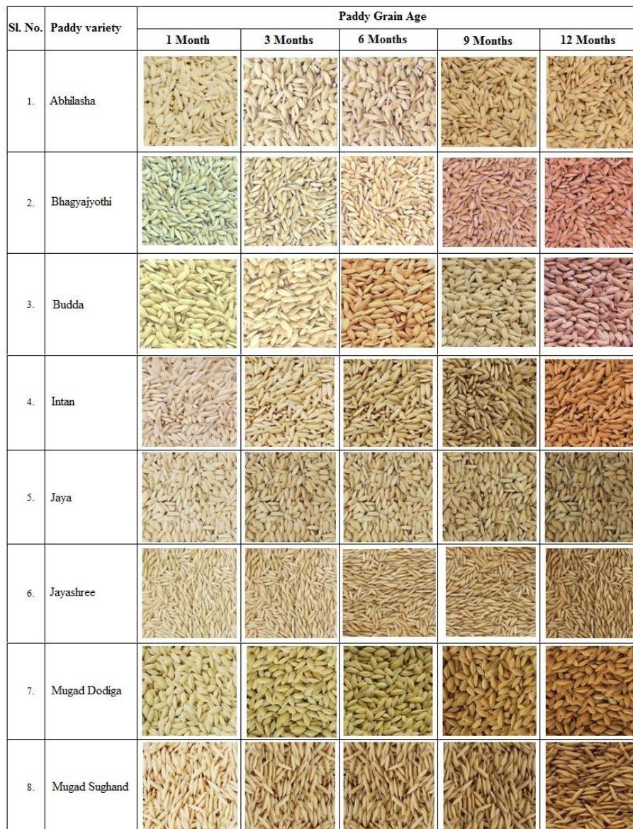
Table 1. Bulk paddy grain images in five different ageing periods.