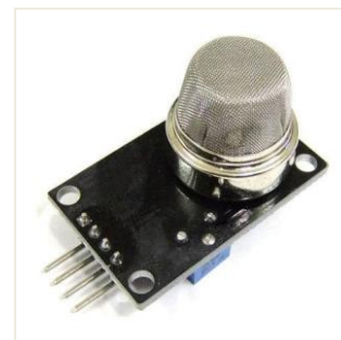
Fig 1: LPG/AC gas leakage sensor unit

LPG might leak as a gas or a fluid. On the off chance that the fluid leaks, it will rapidly dissipate and form an enormous haze of gas which will drop to the ground, as it is heavier than air. At the point when the gas meets a wellspring of start it can burn or detonate. It is delegated as exceptionally combustible and on the off chance that it has more than 0.1% Butadiene; it is likewise named as a carcinogen and mutagen. LPG is non-corrosive yet can dissolve lubricants and plastics.