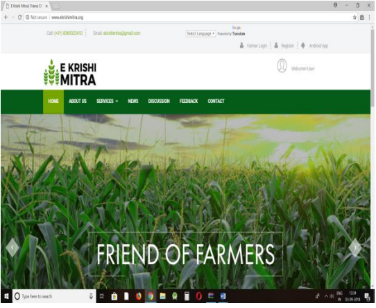
Fig. 1: Interface of e-Krishimitra

The online service provider tool e-Krishimitra[22] (as shown in Fig. 1) has the following functions for users: 1) Government Scheme Information - E-Learning (Providing information of funding schemes, insurance claim form and instructions of PMFBY in the form of multimedia, i.e., text, audio, and video.) 2) Best crop suggestion 3) Crop yield estimation 4) Crop Disease Diagnosis 5) Multilingual support (English, Marathi and Hindi) [1].