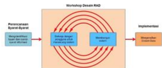
Figure 1. Rapid Application Development (RAD)

Rapid Application Development (RAD) or rapid application development, proposed by Kendall is an object-oriented approach to system development that includes development methods as well as software. Kendall sees RAD as a systems development methodology that seeks to address changing user requirements and recommends RAD for developing web-based applications. According to Pressman, RAD is a soft process model that emphasizes a short development life cycle. Meanwhile, according to Schach, a rapid prototype model is a working model where most of the functional applications are already running [13].