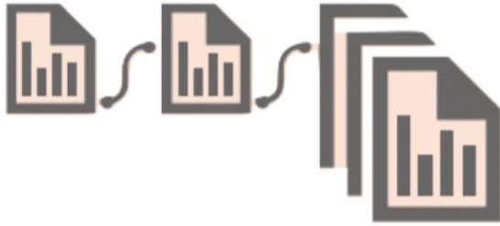
Figure2: Formation of Blockchain