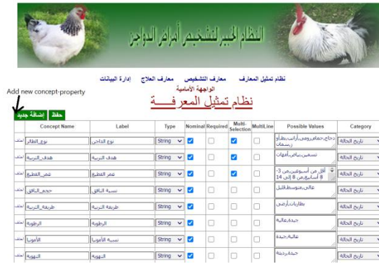
Fig 2: Ontology editor

Each concept-property has a set of attributes to describe it, for example, label, nominal, and required for search. In the case of concept-property is nominal we have to add the legal values of it, such as breeding objectives, Liver color, and the kidneys status.