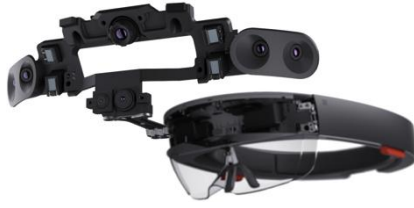
Figure 2. Hardware Involved in Microsoft HoloLens