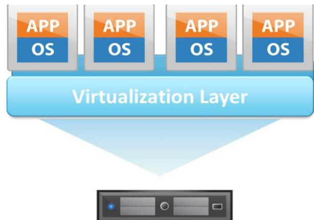
Figure 2: Virtualization

Resource utilization is one of the key aspects of the cloud provider. For this purpose they use the virtualization technique which allows the sharing of the physical resources. Virtualization [7] allows the provider to divides the single physical resources into multiple according to the user need. Hence virtualization is the key technology in the cloud. It logically divides the physical resources into multiple and assigned the user in the form of virtual machine (VM) as shows in figure 2.