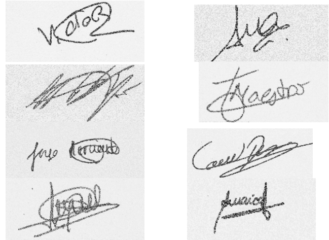
Figure 3. Samples signatures from MCYT_signature corpus

Experimental Setup: The MCYT_signature subcorpus is split into training and testing sets. We trained the system with training set of 5, 7 and 9 genuine signatures of each individual selected randomly. The test set consists of the remaining samples of genuine signatures and all the forgery signatures. Our procedure is similar to the international signature verification competition SVC 2004. We have used normalized distances and orientations features for our experimentations. For evaluation of the proposed method for verification performance, in this work we adopt AER (Average Error Rate), which is average of FAR (False Acceptance Rate) and FRR (False Rejection Rate).