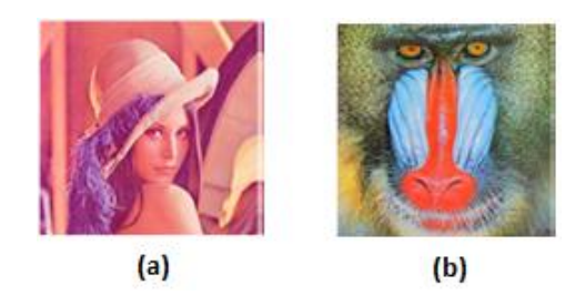
Figure 2: (a) Lena Image (b) Baboon Image

A number of techniques have been proposed for embedding and extracting a watermark in a digital medium using neural networks. A review has been done on the same area and it is given briefly below. Figure 2 shows the sample Lena and Baboon images that have been used for the analysis of most of these methods.