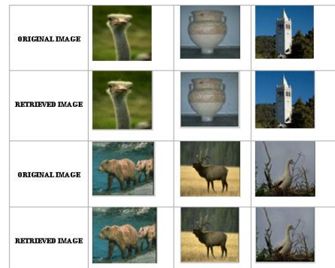
Figure 3: Original and Retrieved Images

Image Fidelity, (c) Mean Square Error, (d) Signal to Noise Ratio and (e) Image Quality Index. Using the estimated probability density functions of the images under consideration the retrieved images are obtained and shown in Figure 3.