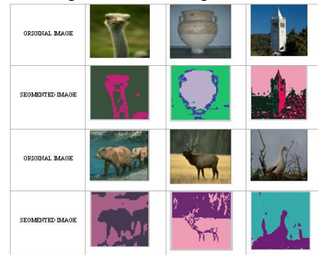
Figure 2: Original and Segmented Images

Using the estimated probability density functions and the image segmentation algorithm given in section 5, the image segmentation is done for each of the six images under consideration. The original and segmented images are shown in Figure 2.